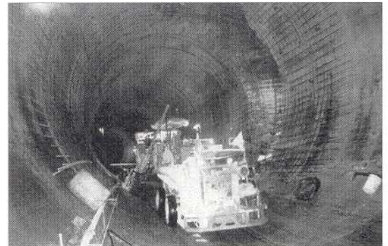
TUNNEL VISION: The plaintiff was injured in a January 1996 accident at this deep tunnel project located in Morton Grove, Ill.